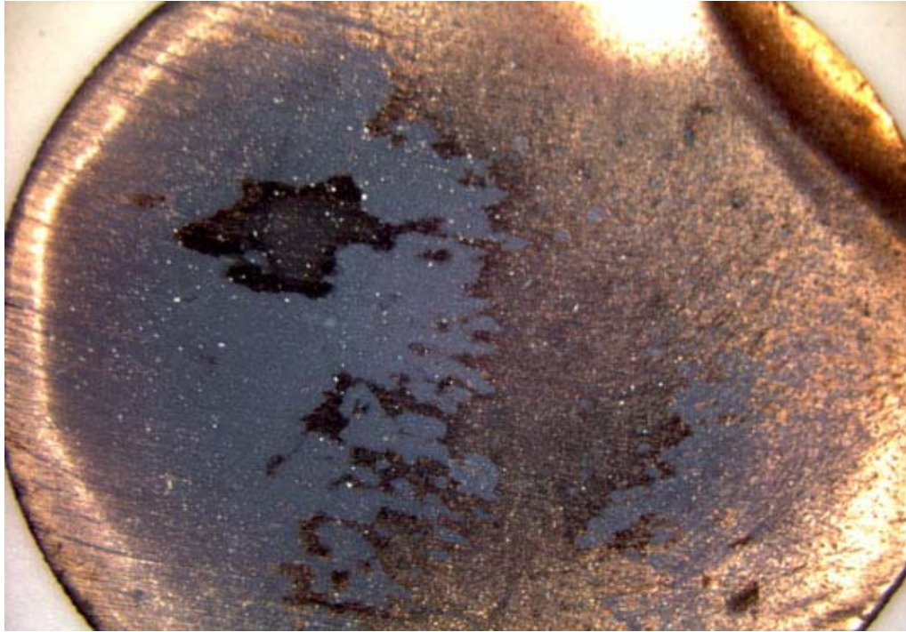
Figure. Stereomicrograph of a copper token exposed to the submitted drywall sample.

The corrosion characteristics of the sample drywall is consistent with corrosion that occurs on a copper token exposed to Chinese drywall reference materials, including the formation of a grayish-black patina on the copper surface.